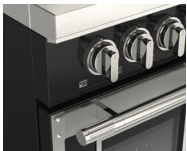
F4EIR486CS1-BK GLOSSY BLACK RAL 9004