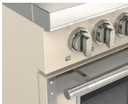
F4EIR486CS1-IV GLOSSY IVORY RAL 1015